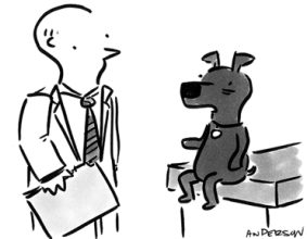
"Lately the best I can smell is trepidation."